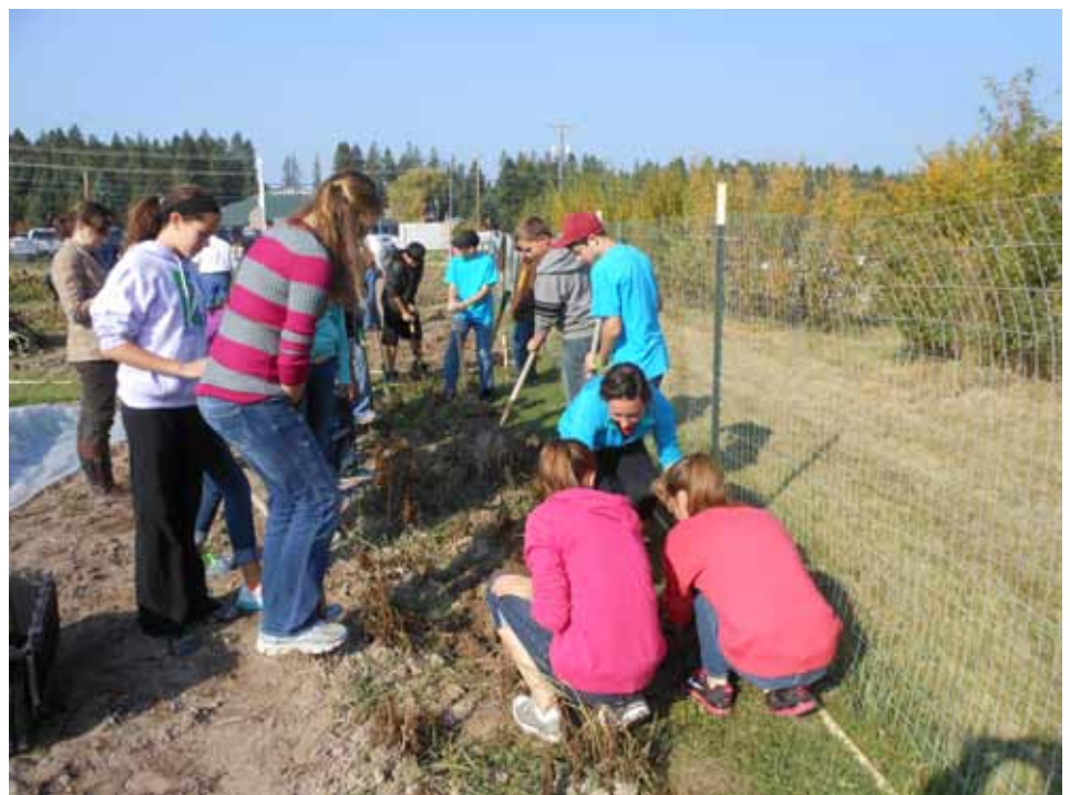
Whitefish Middle School Students digging potatoes after a frost.