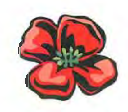
Invite you to the