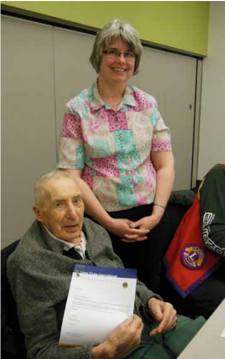
I started out with nothing and I still have most of it