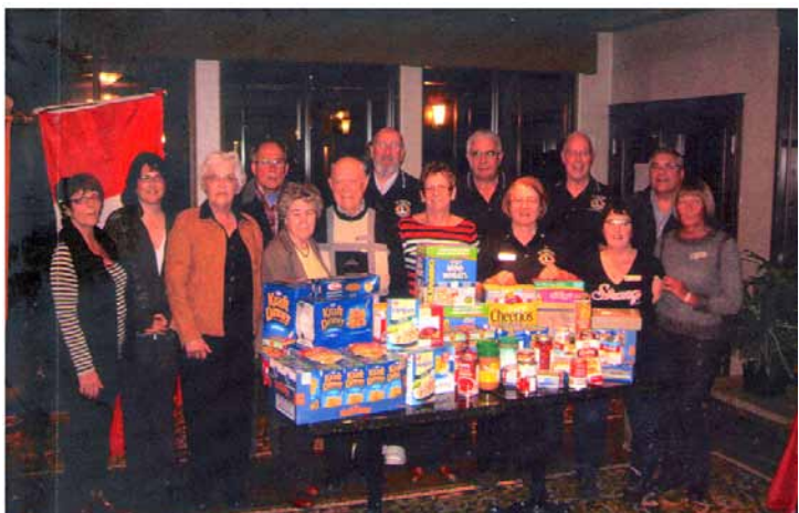
Fort Saskatchewan Lions collected over 400 pounds of food at their November 20 Lions Club meeting