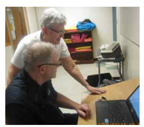
(Damn, but this getting bald sneaks up...)